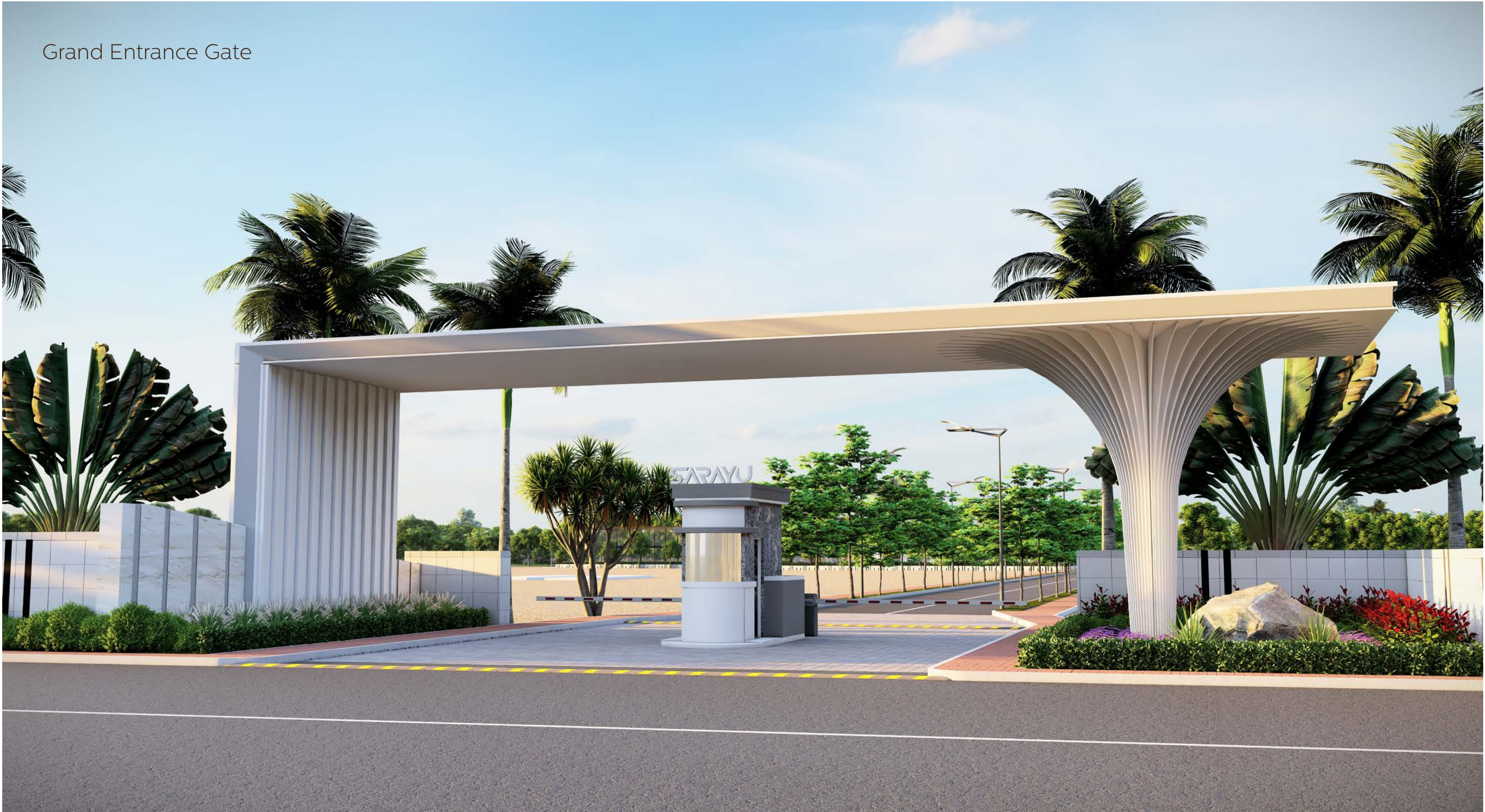
Grand Entrance Gate