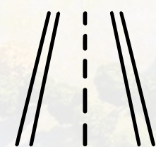
High Quality Blacktop Roads

At Assure Sarayu , infrastructure is not an add-on. It is the very backbone of the community. Every road, utility, and facility is thoughtfully laid out to ensure a smooth, future-ready lifestyle. This is a neighborhood designed to grow with you; reliable, sustainable, and built to last.