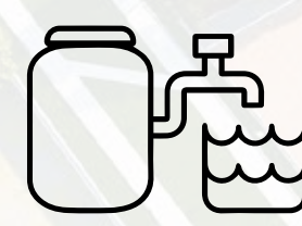
Sewage Treatment Plant