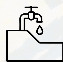
Plot-Level Water Access